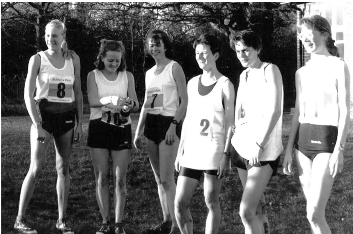
Oxford's victorious ladies' team in 1993.