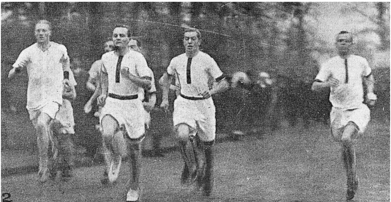
The start of the first race after the Great War in December 1919. The runners head up Roehampton Lane towards the Common.